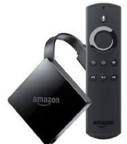
Amazon Fire TV